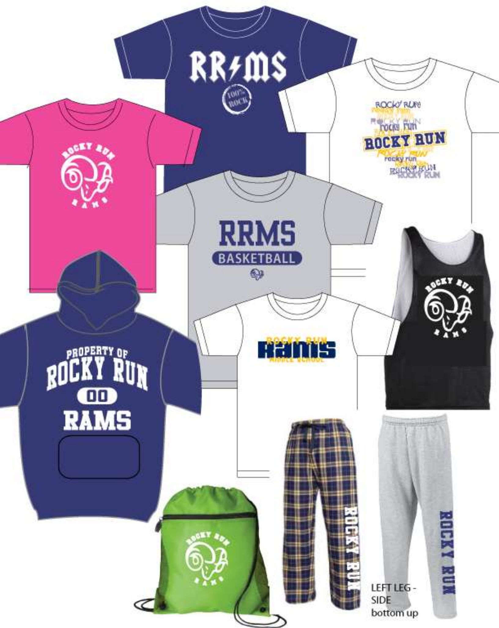
LEFT LEG - SIDE bottom up